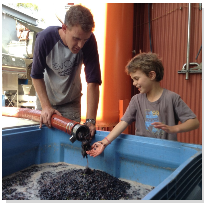
Giving dad a helping hand as we crush our dry grown bush vine Grenache for the 2014 Bimini Twist Rose